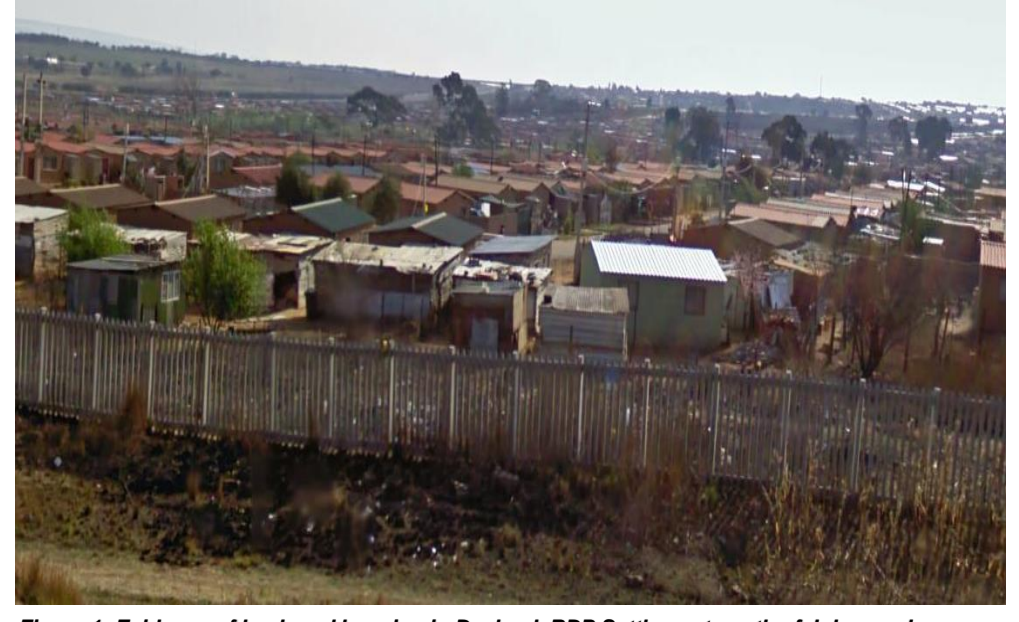
Figure 1: Evidence of backyard housing in Devland, RDP Settlement south of Johannesburg

This policy brief focuses on a specific form of informal housing in South Africa. Backyard Housing – also referred to as backyard dwellings or backyard 'shacks' - provide small scale affordable rental housing opportunities to a spectrum of people in the country in a context where affordable housing alternatives are few and far between. Although the South African government has tried its best to address a low-income housing 'crisis' in the post-apartheid period through its Housing Programme, informal housing continues to characterise South African settlements, especially within metropolitan regions. Within this informal housing umbrella, backyard housing fulfils a crucial housing function: it provides flexible, affordable accommodation (generally built by tenants) with the comfort of better access to services such as electricity, water and sanitation (Crankshaw et al, 2000; Watson and McCarthy, 1998; Lemanski, 2009; Gardner, 2010; Shapurjee, 2010). Backyard housing is thus a natural and preferred progression from the often congested and unsanitary living conditions of informal settlements. The South African Institute of Race Relations (2008:1) confirms this trend stating that during the period from 1996 to 2007 'backyard informal structures as a proportion of total informal dwellings grew by 18%'.